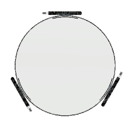
Multi 3 Part Clamps